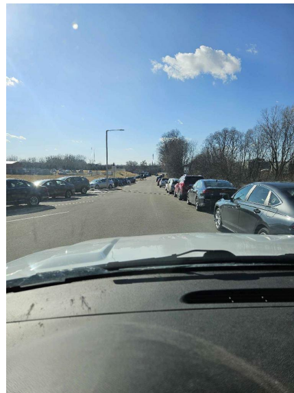
Photos taken last year showing the limited space for two-way flow of traffic.